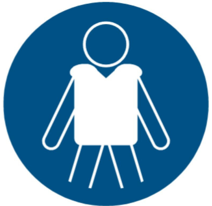
Wear personal flotation devices