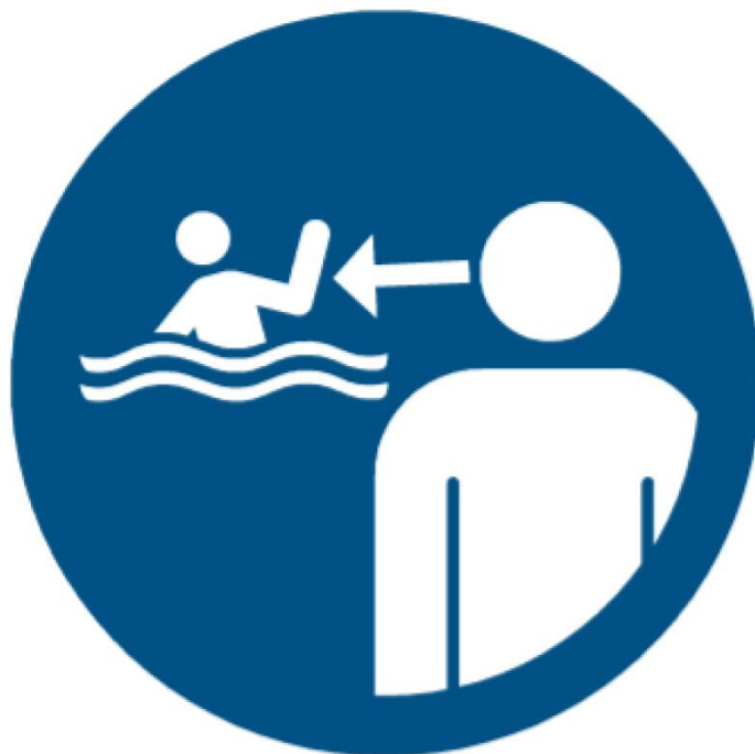
Keep children under supervision in the aquatic environment