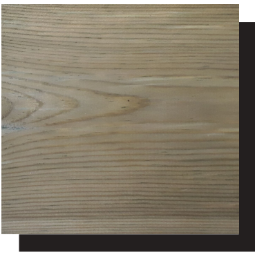
Fresh wood: after 3-5 days