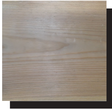
Wood: after about 6 months