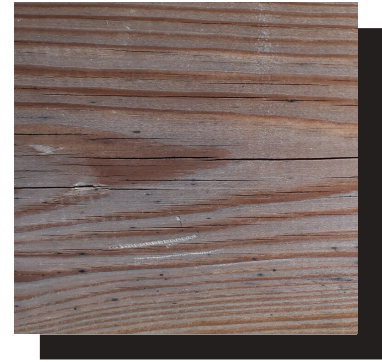
Old wood: after more than 1 year