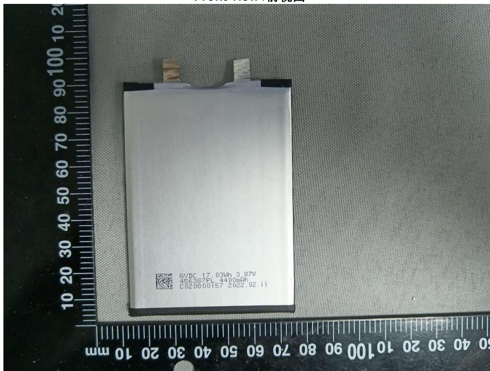
Back view / 后视图