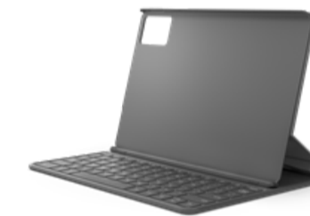
Lenovo Folio Keyboard for IdeaTab