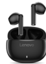
Lenovo E310 True Wireless Stereo Earbuds (Black)