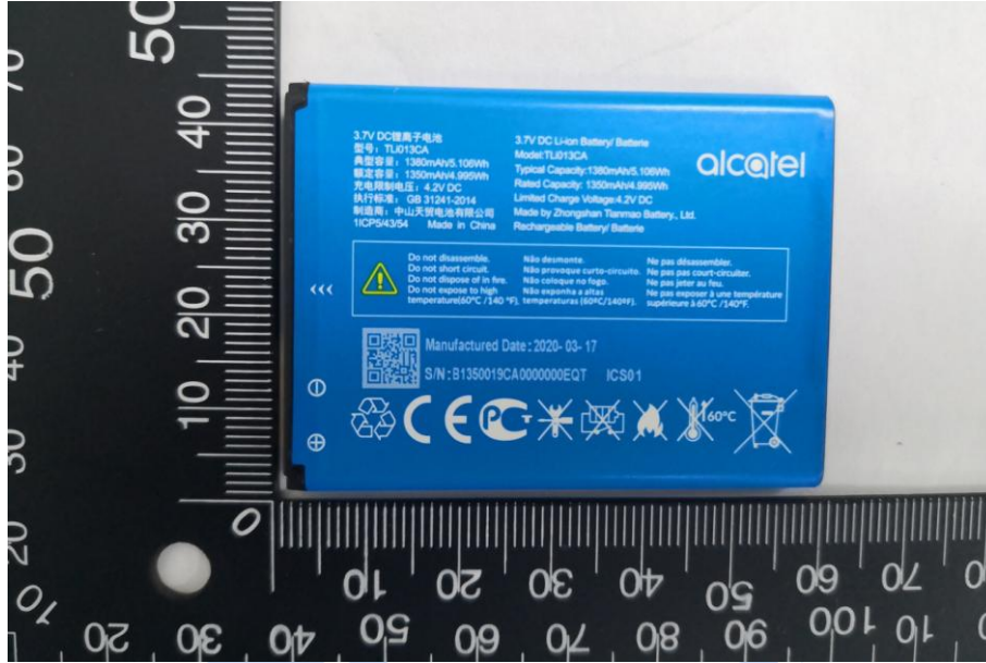
Fig. 1 – Front view of Battery