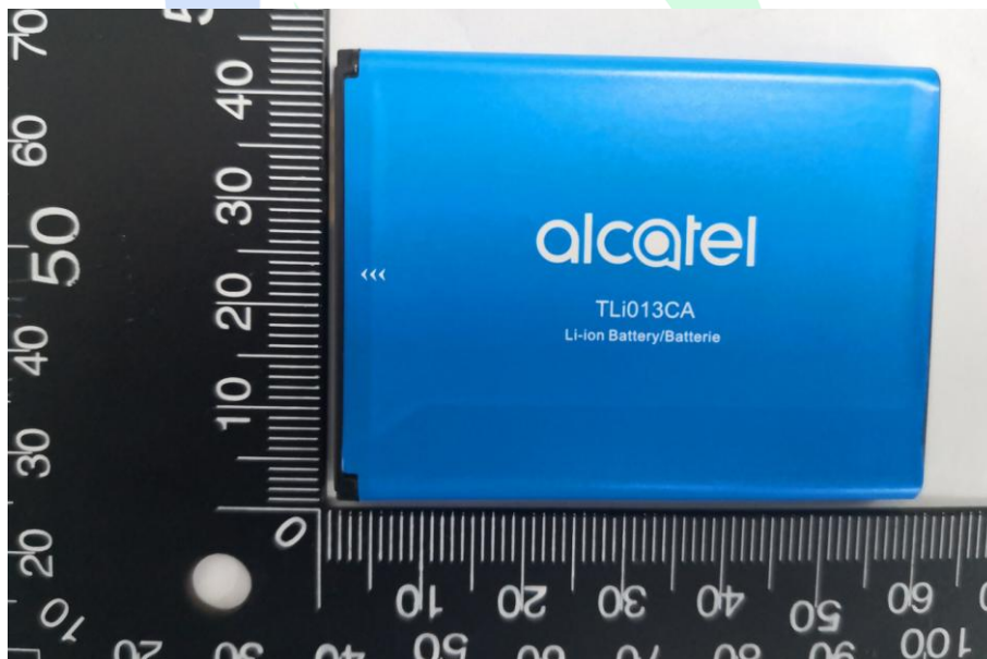
Fig.2 – Back view of Battery