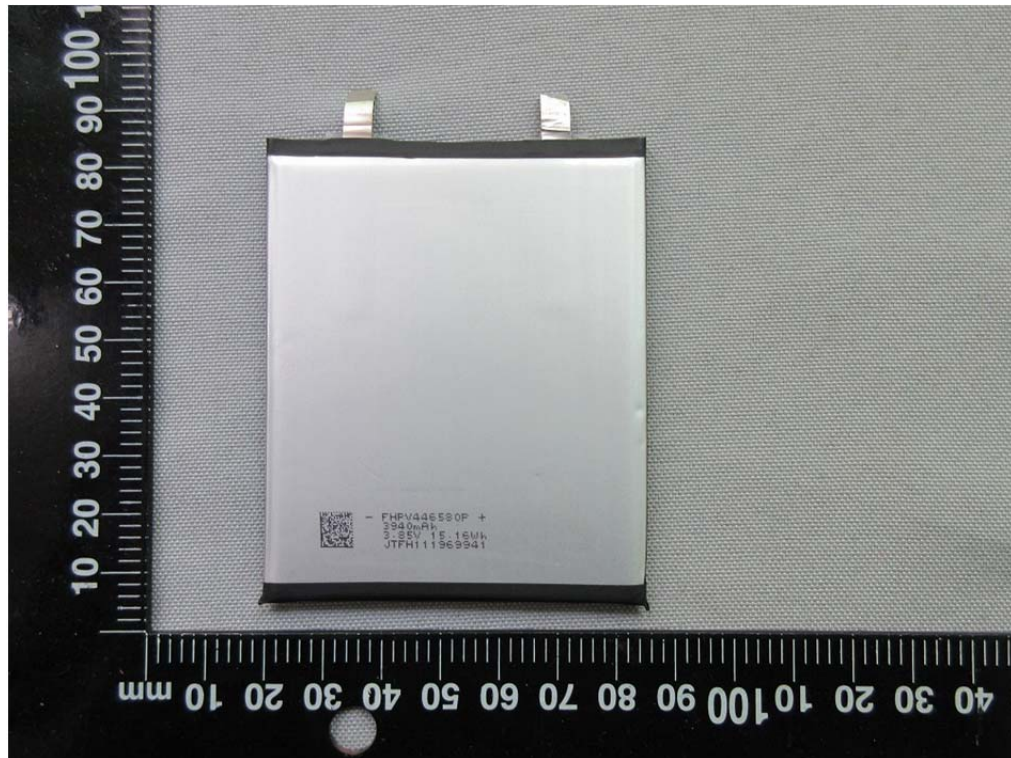
Back view /后视图