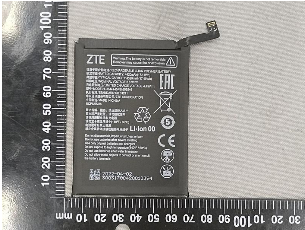
Back view / 后视图