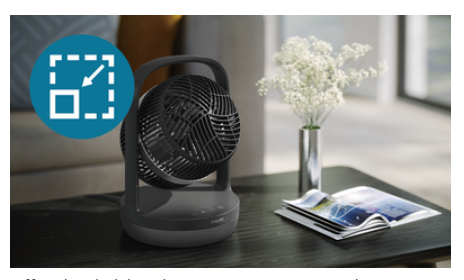
Effortlessly blending convenience and simplicity, our fan features a hidden blade design, for a clean and minimalist aesthetic. Compact and discreet, it saves space without sacrificing performance.