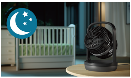
Enjoy a cool and peaceful night's sleep with the Quiet Sleep mode. This mode gradually decreases the fan speed to the lowest setting over 30 minutes, helping you fall asleep naturally while also conserving energy.