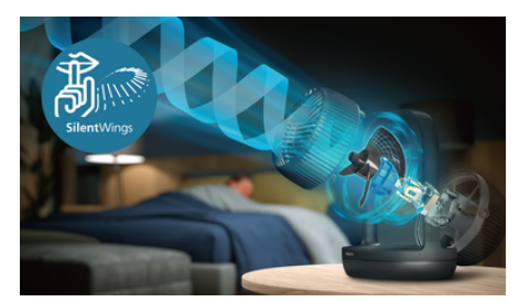
Experience 30% quieter operation with our innovative SilentWings technology (1). Drawing inspiration from the silent wings of nature's quietest flyer, the owl, our blade design ensures a quieter cooling experience with noise levels as low as 23 dB(A) (2) - quieter than a whisper!