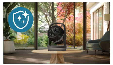
Made to last, season after season. With over 80 years of air care expertise, Philips performs over 110 rigorous tests on their fans before release, ensuring high quality and performance.